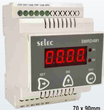
70 x 90mm