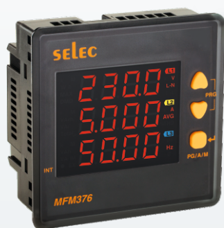
96 x 96mm