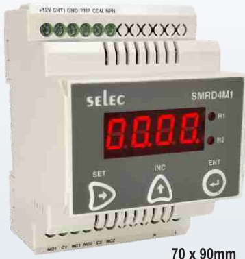
70 x 90mm