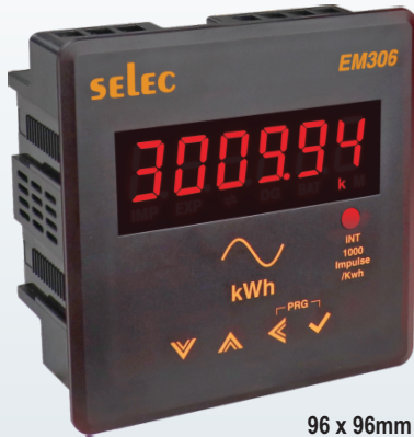
96 x 96mm