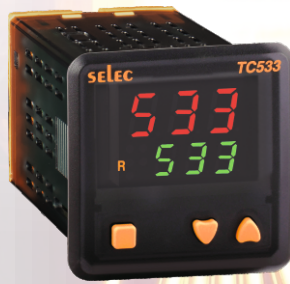
48 x 48mm