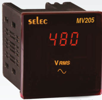
72 x 72mm