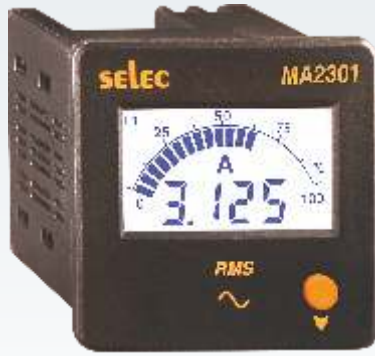
72 x 72mm