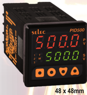
48 x 48mm