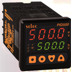
48 x 48mm