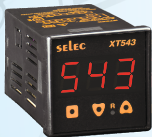
48 x 48mm