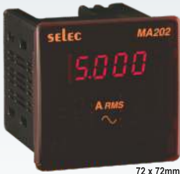
72 x 72mm