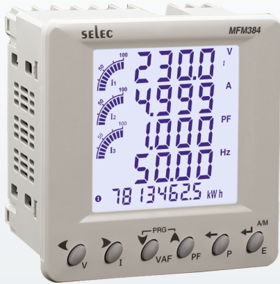
96 x 96mm