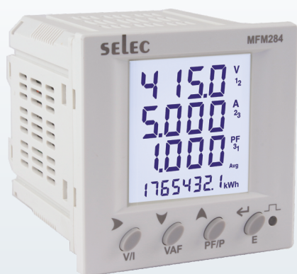
72 x 72mm