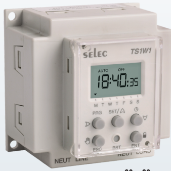
60 x 60mm