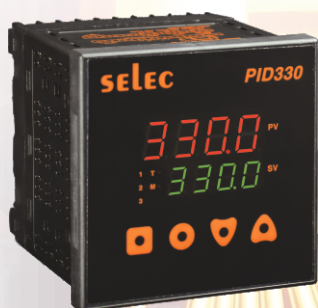
96 x 96mm