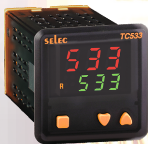
48 x 48mm