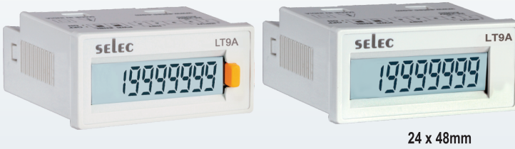
24 x 48mm