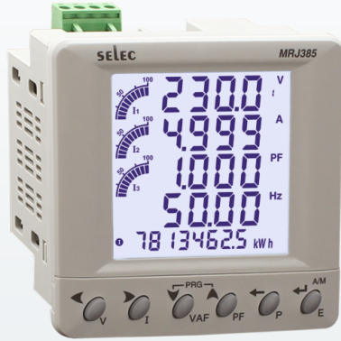
96 x 96mm