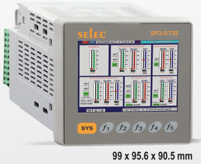
99 x 95.6 x 90.5 mm