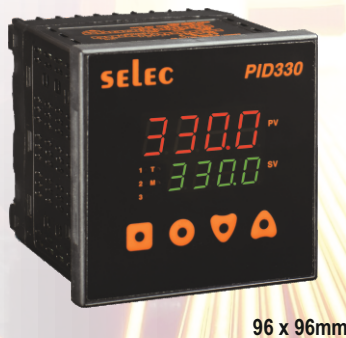
96 x 96mm