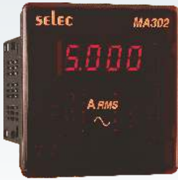
96 x 96mm