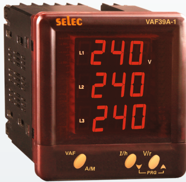
96 x 96mm