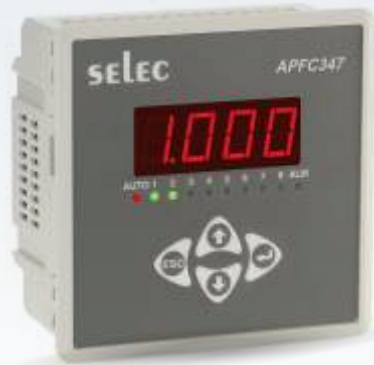
96 x 96mm