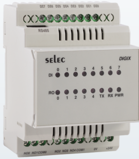
70 x 90 x 66.4mm