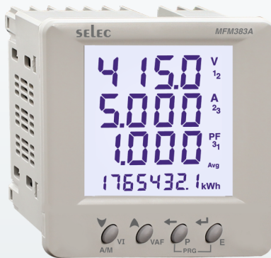
96 x 96mm