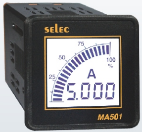
48mm x 48mm