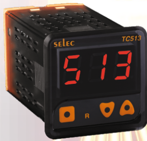
48 x 48mm