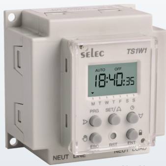
60 x 60mm