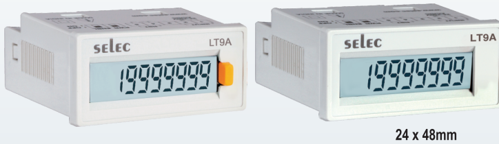
24 x 48mm