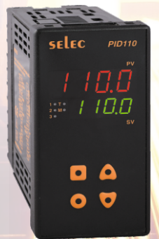
96 x 48mm