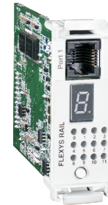
Figure 1.1 : Front view