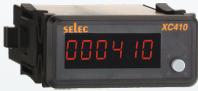
36 x 72mm