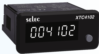
36 x 72mm