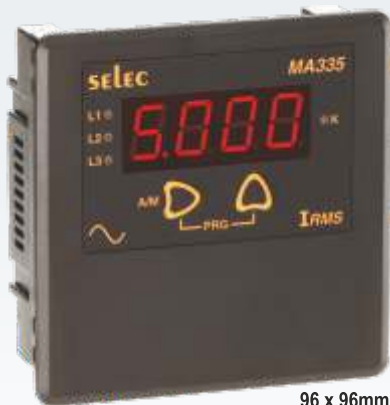
96 x 96mm