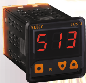
48 x 48mm