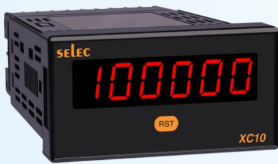
48 x 96mm