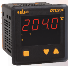
72 x 72mm