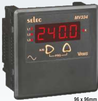
96 x 96mm