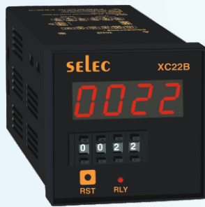
72 x 72mm