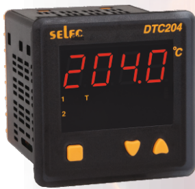
72 x 72mm