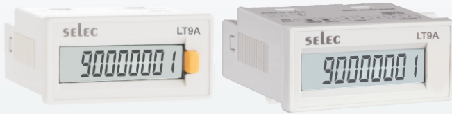
24 x 48mm